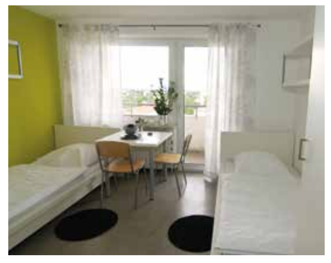
Student Residence Standard Room Sample